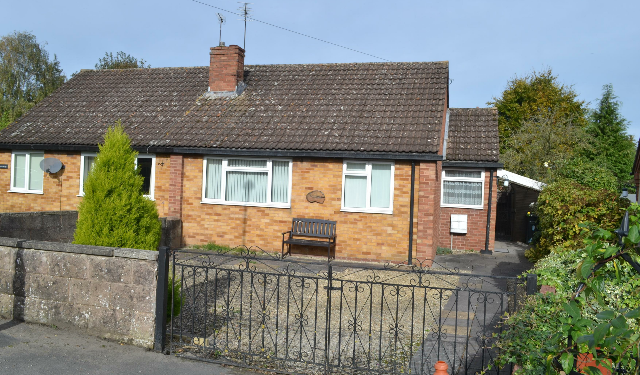
Rosedene Aldermans Meadow, Leominster, HR6 8LB. £180,000