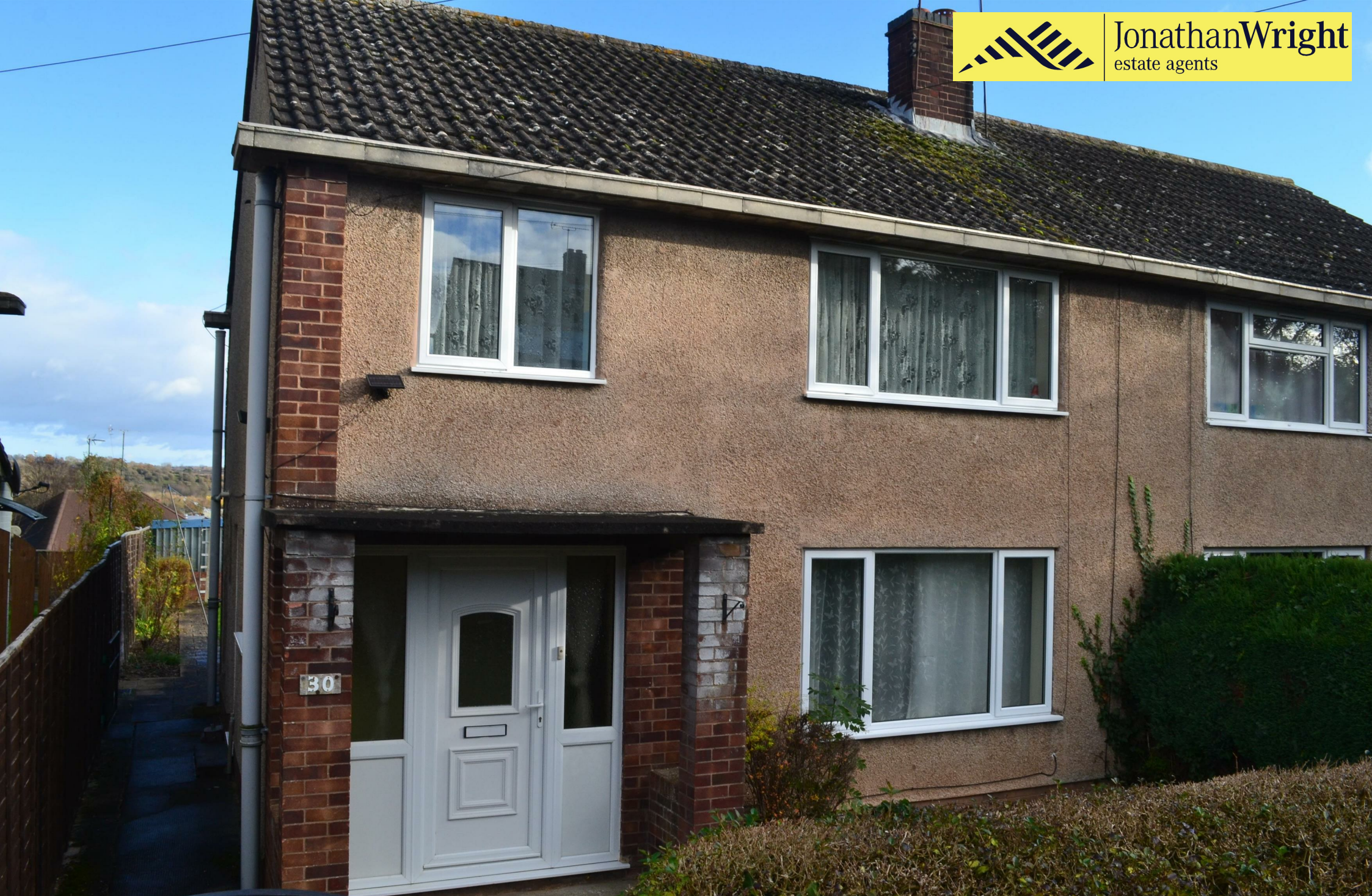
30 Wigmore Street, Leominster, HR6 8PJ. £190,000