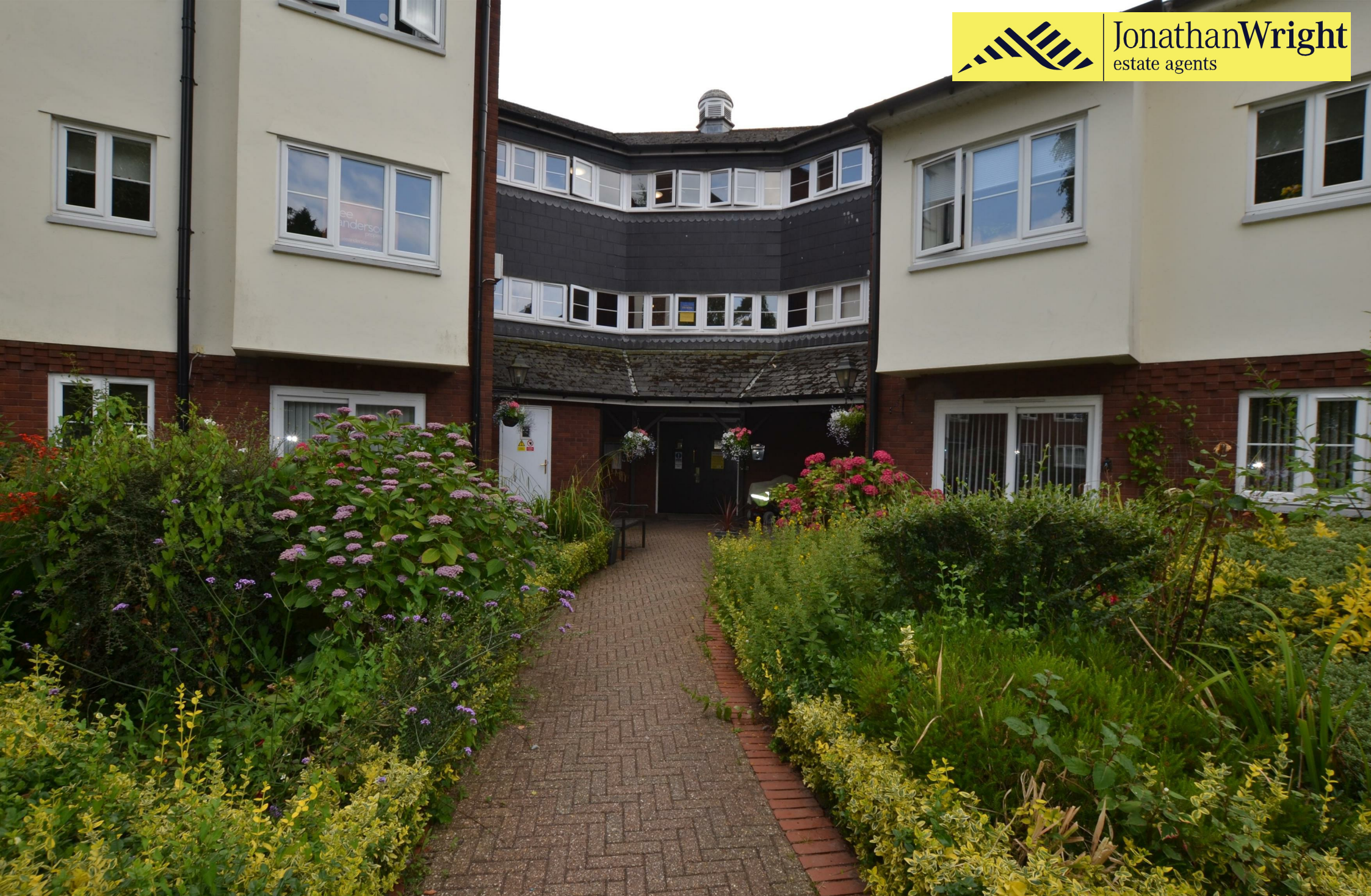
Flat 54 Townsend Court, Leominster, HR6 8TD. £69,950