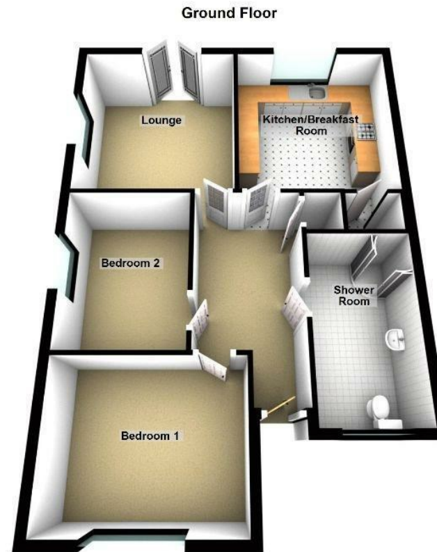
SUNOVA, ALDERMANS MEADOW, LEOMINSTER