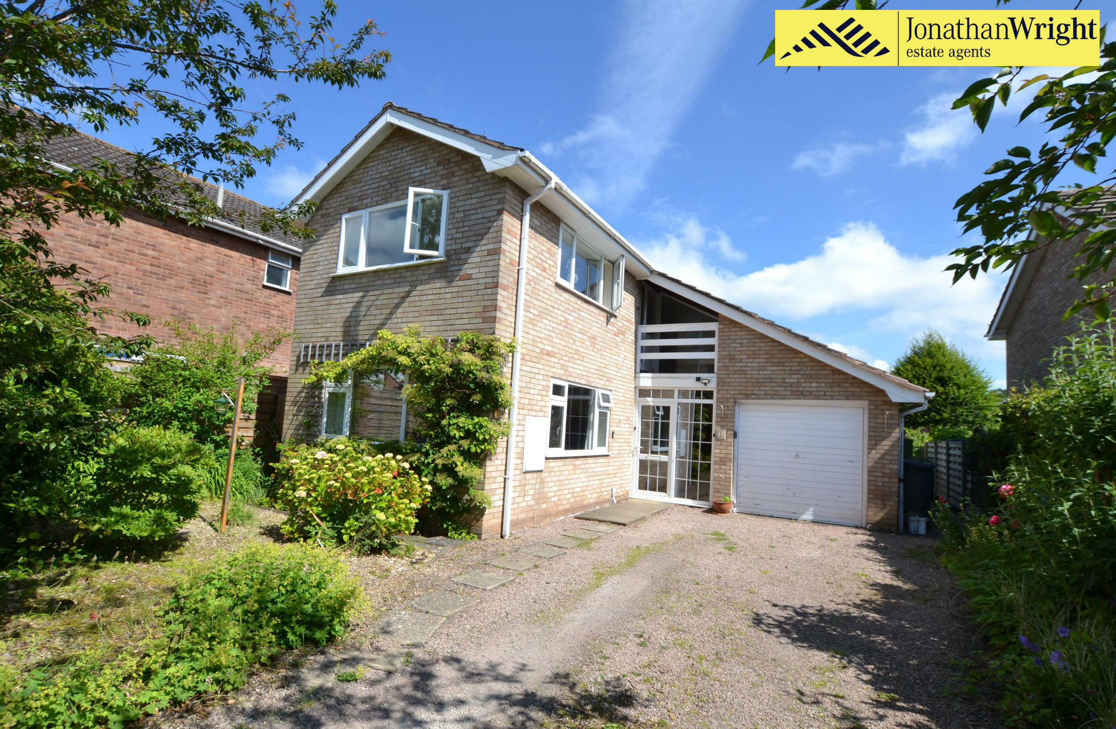
1 Swan Orchard, Alfrick, WR6 5HZ. £400,000