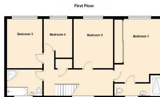
4 Presbytery Close, Leominster