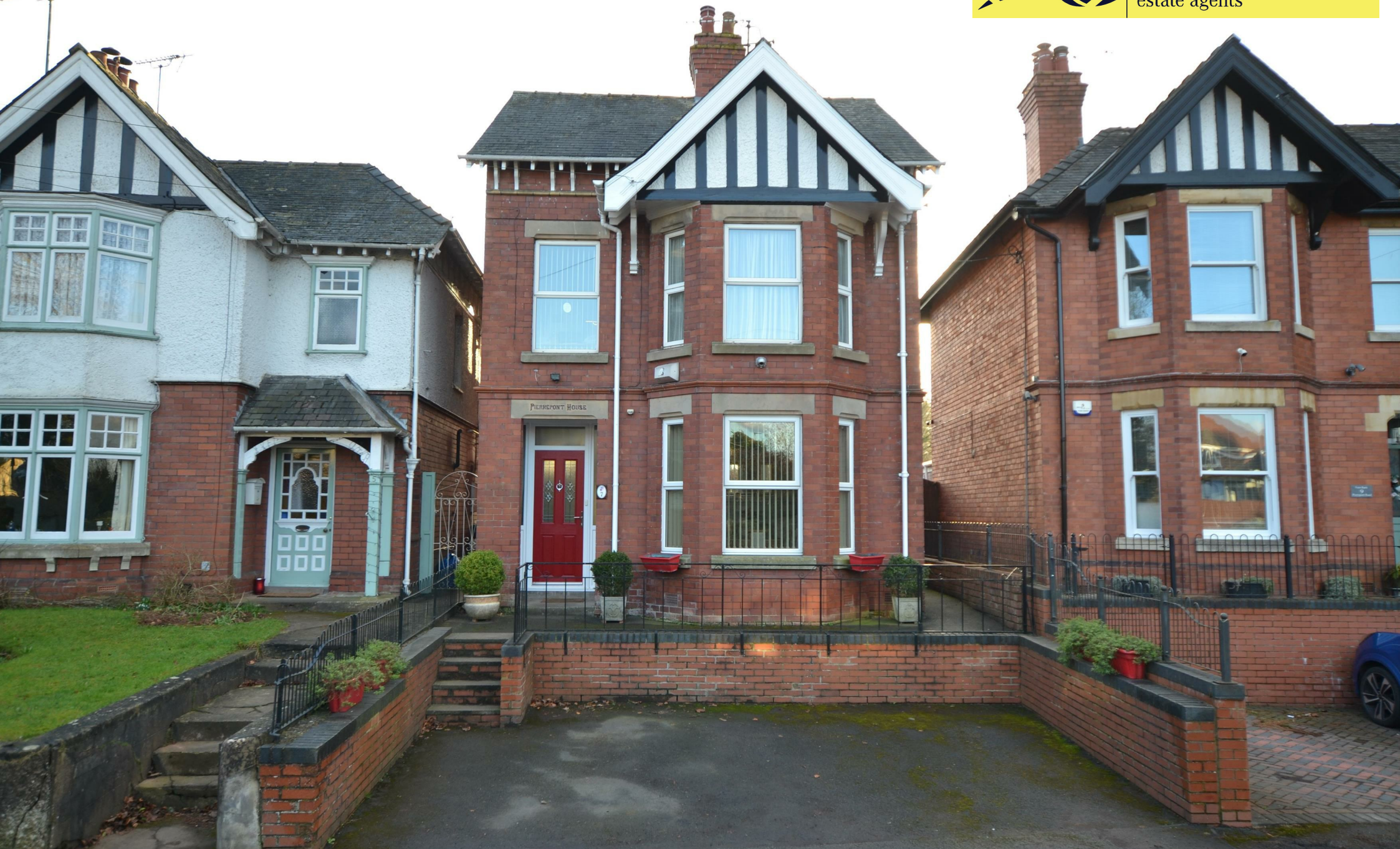
Pierrepont House, 7 Pierrepont Road, Leominster, HR6 8RB. £425,000