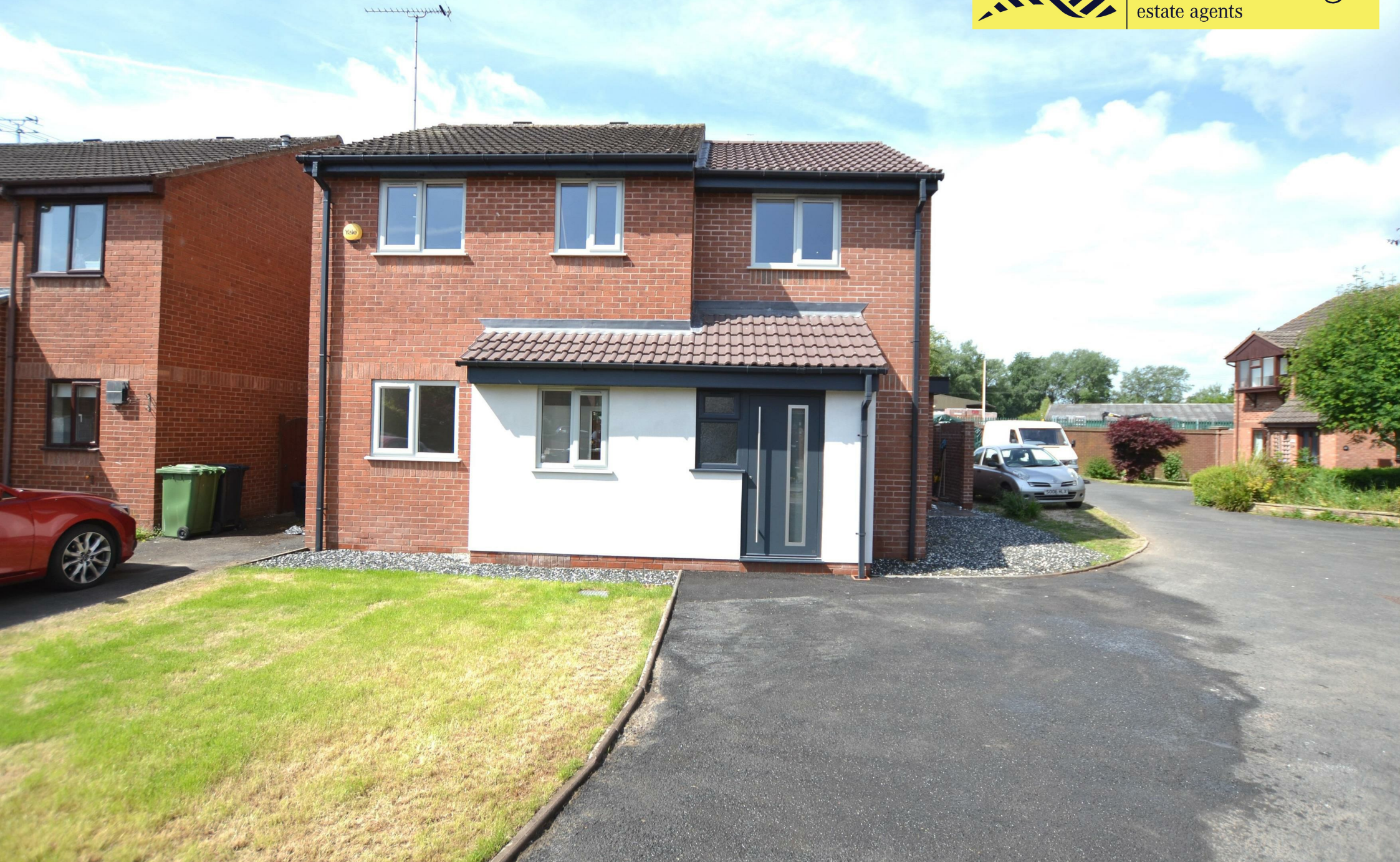
202 The Mallards, Leominster, HR6 8UN. £334,000