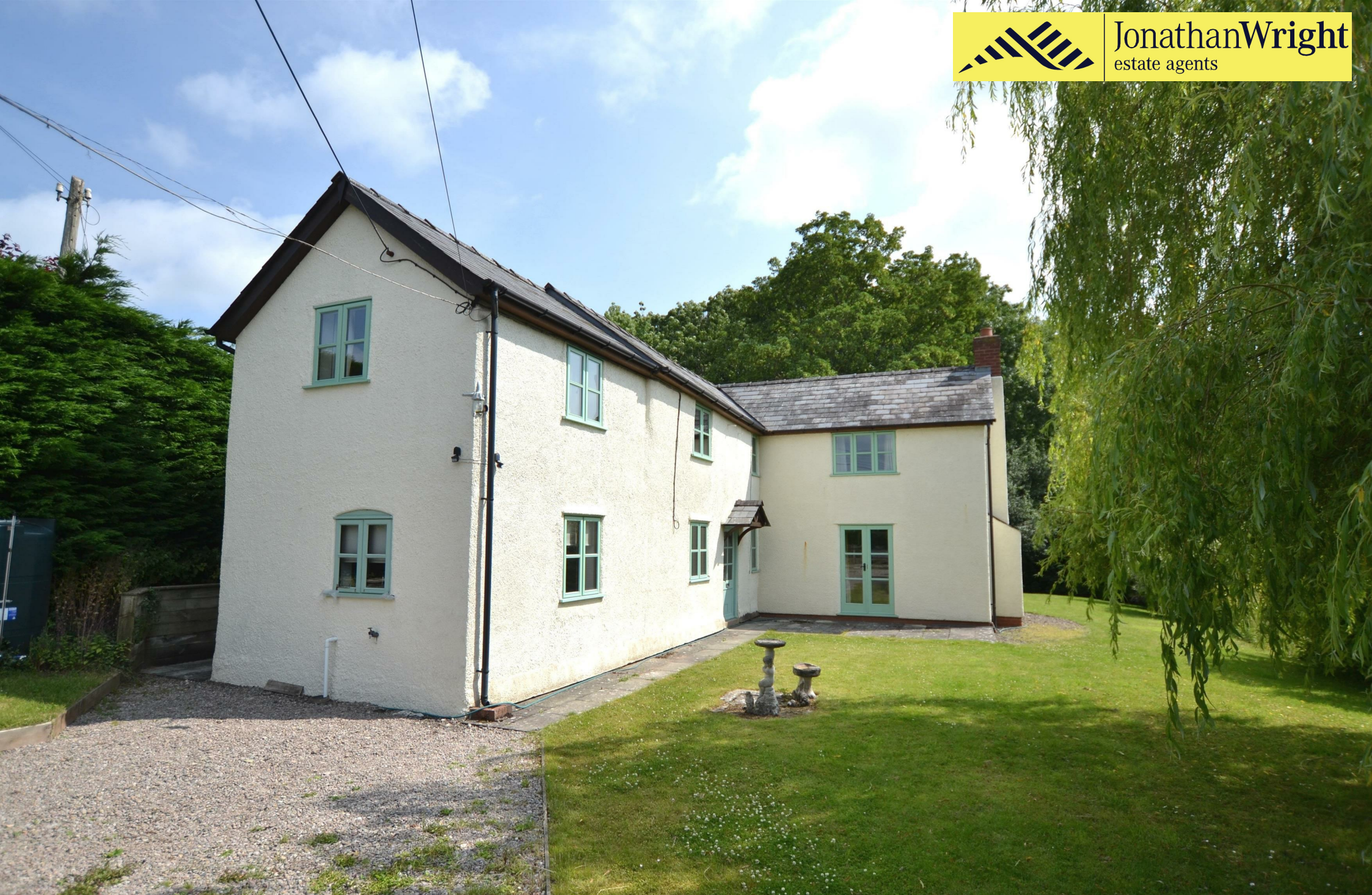
Willow Cottage , Bearwood, Herefordshire HR6 9ED. £475,000