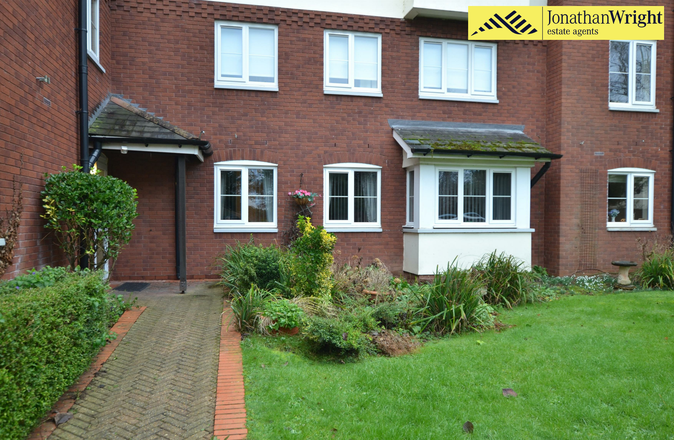
Flat 10 Townsend Court, Green Lane, Leominster, HR6 8TD. £115,000