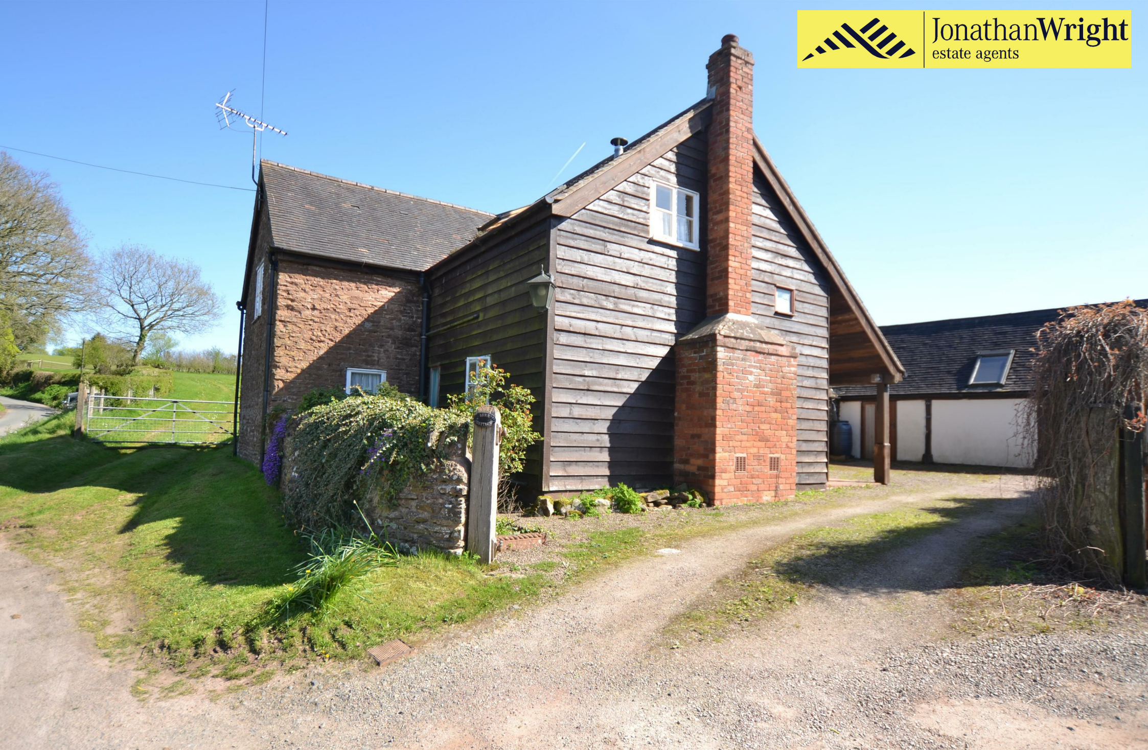
Barn Cottage , Hatfield, Herefordshire HR6 0SF. £530,000