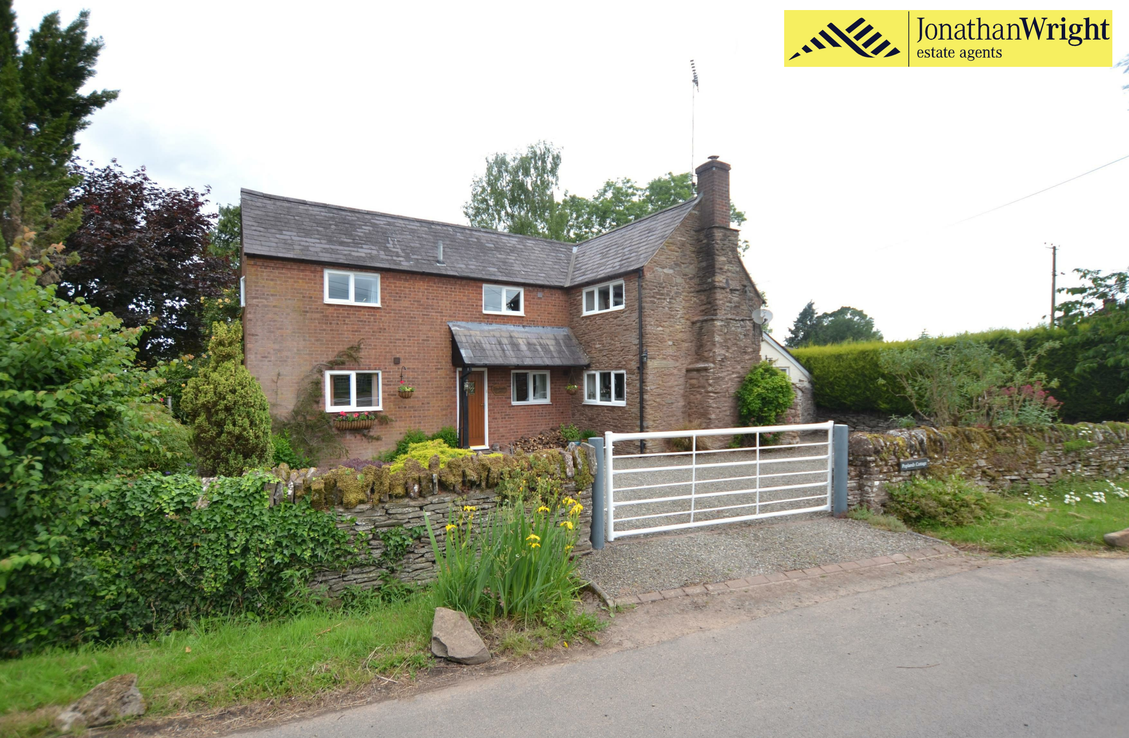
Poplands Cottage, Risbury, Nr Leominster, Herefordshire HR6 0NN. £575,000